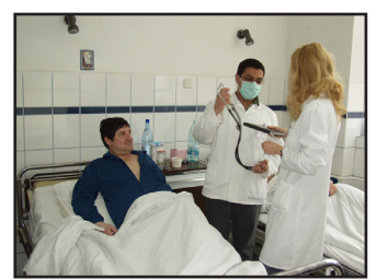
Clinical practice Internal medicine-cardiology